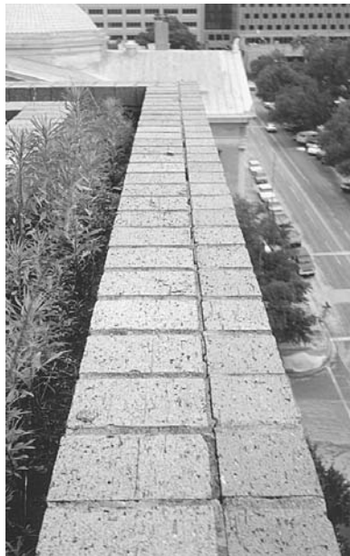
Figure 9-51 Brick rowlock copings have a high probability of cracking.